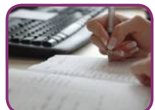
Self-certification to end