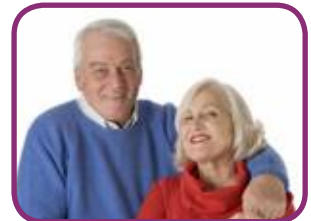
Later retirement looms