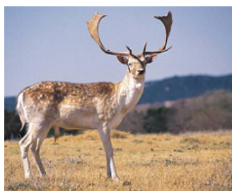
Hopefully, we can keep this stag at bay