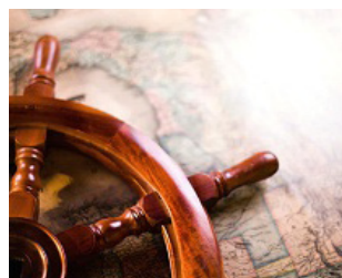
Steady as she goes

Confidence is the key Despite claims by such figures as Sir Richard Lambert, outgoing head of the Confederation of British Industry, that the coalition has taken its eye off the ball as far as growth is concerned, it appears that there is no "plan B". Whether or not the coalition is correct to focus entirely on cutting spending while apparently hoping that its tax revenues will be sustained, we