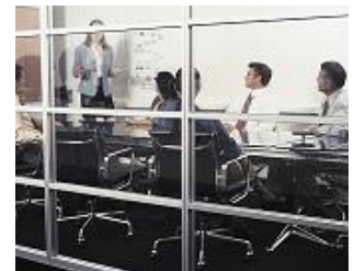
Businesses may hold the future of our recovery

According to the Bank of England's Agents' Summary for January, investment intentions in manufacturing are now broadly in line with those seen prior to the recession. Employment intentions are also in positive territory, although to a lesser extent, with both manufacturing and services anticipating only modest growth over the next six months. It may appear that 'modest' growth will be inadequate to make up for public sector job losses, but it should be remembered that those losses will not all take place within the current year. In any event, private sector jobs are arguably more economically valuable at the moment, because they generate